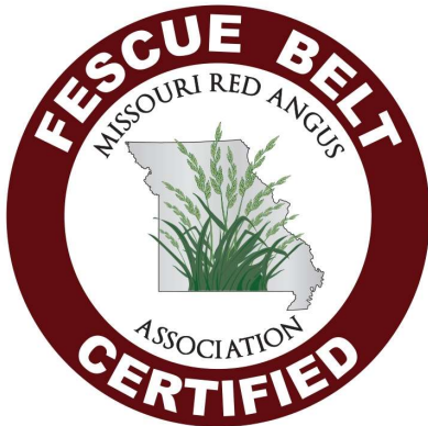
Official MORAA Fescue Belt Certification Logo

The Missouri Red Angus Associations Board of Directors recently approved the “Missouri Red Angus Association Fescue Belt Certified” program as an initiative designed to promote Missouri Red Angus members genetics.